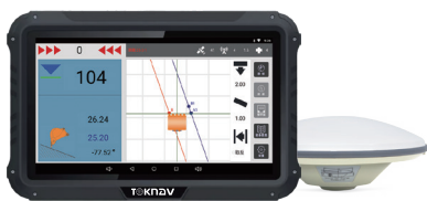
Intelligent Display Screen